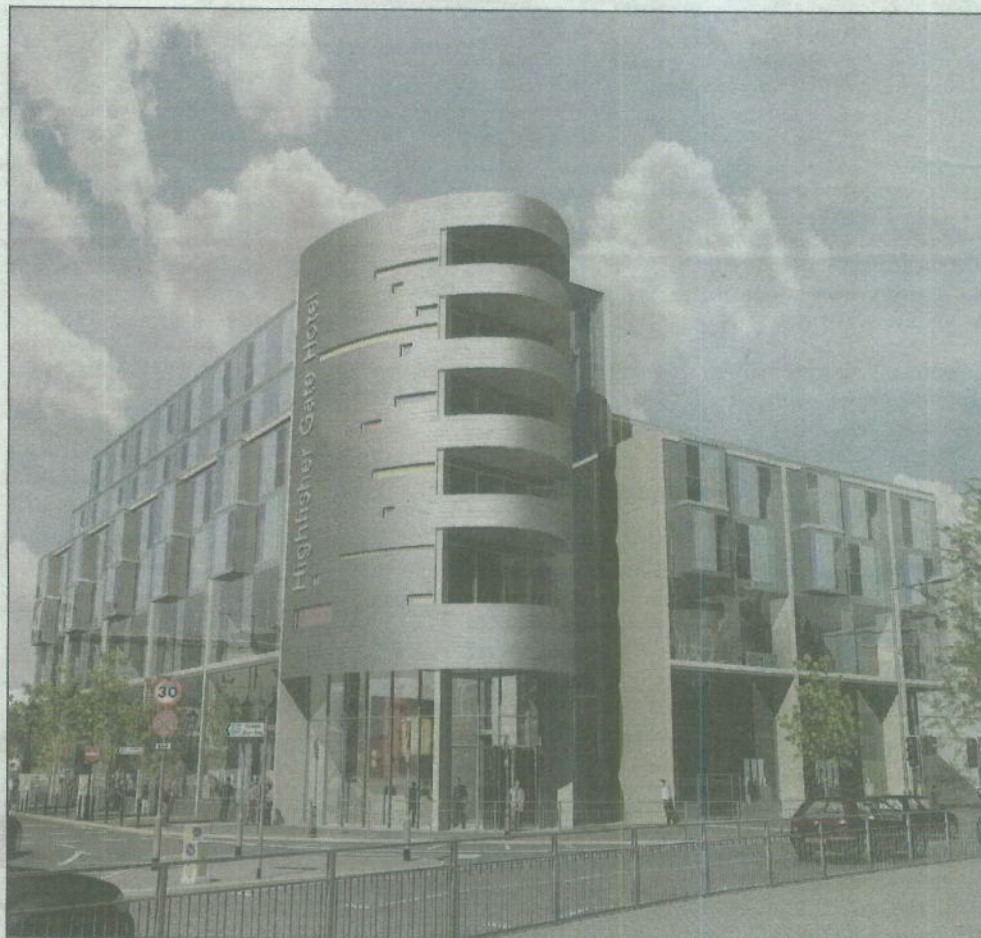
ROOM AT THE TOP: Leading developer Lazarus Properties' proposed business class hotel in Doncaster.

develops and supplies high-performance computer systems to customers including BT, RBS and the London Stock Exchange. It has 350 staff.